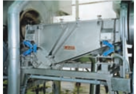
JÖST vegetable dewatering screen, originally coil spring suspension replaced by ROSTA AB-38 mounts