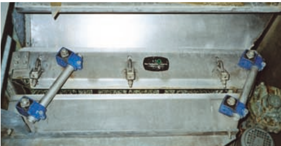
Key feeding device, originally mounted on 3M fibre leaf springs, now equipped with ROSTA rocker arms type AR-38