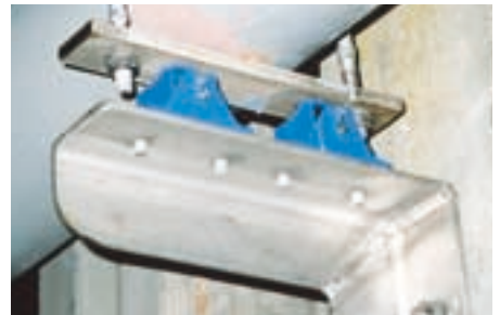
Elastic suspension of hot steam pipes on anti-vibration mountings type V-38 (compensation of heat-induced expansion).