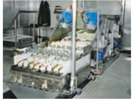
Lubbot-Wacker feeding and dewatering screen, originally equipped with coil spring mounts, retrofitted on ROSTA AB-45 oscillating mountings.