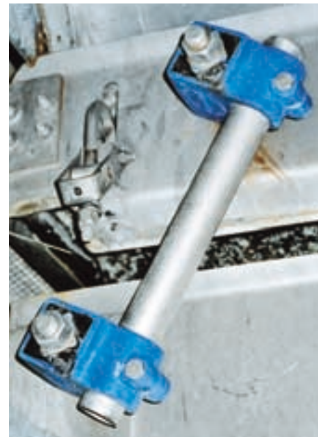
Rocker arm type AR-38

frigemo Produktions AG is a leading Swiss company specializing in the processing of potatoes, vegetables, fresh salads and pasta. Contracts with the big supermarkets and restaurant chains in Switzerland demand prompt daily delivery of the fresh goods – usually before dawn. Mr Hans Winzenried must be able to rely on his large fleet of machines, screens, sifters and dewatering troughs. Otherwise, the goods could not be dispatched in good time.