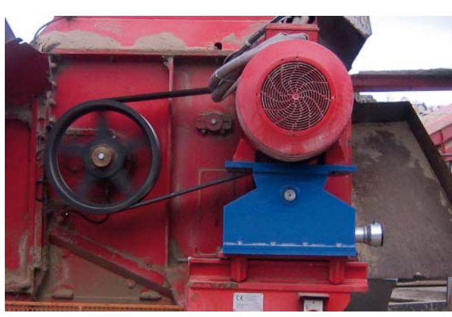
Automatic compensation of the belt elongation