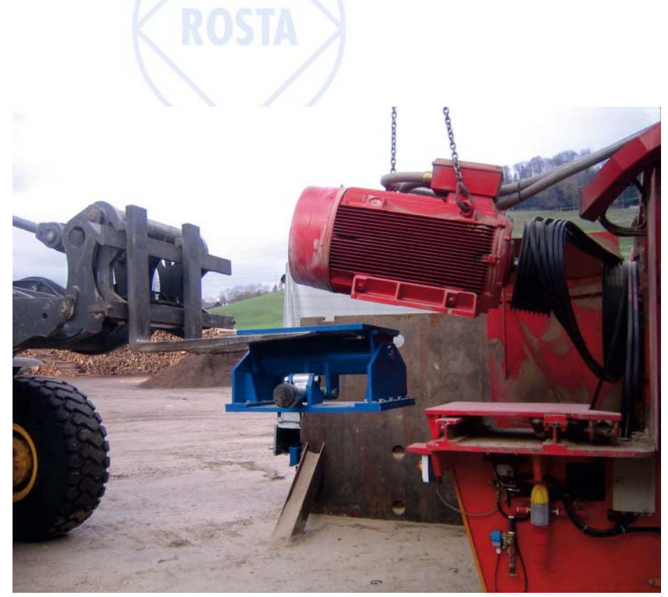
Setting of the Type MB 100 motorbase

The torsionally-elastic ROSTA Type MB motorbase , with its slip-compensating operation, is the ideal, maintenance-free suspension for the drive motors of friction belt drives. The elastically supported drive motor, mounted on a motor plate that is pre-ten-