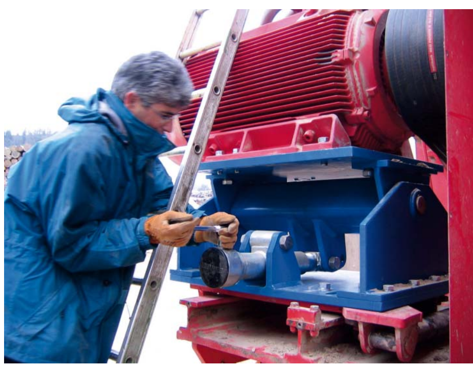
Tensioning the belt using a spindle gearbox

the chipping of root timber and recycled wooden waste lead to excessive elongation of the drive belts, which results in an almost daily, ritual re-tensioning of the belts and re-alignment of the motor. Hard work, which requires an expensive hour of work from two factory mechanics every time.