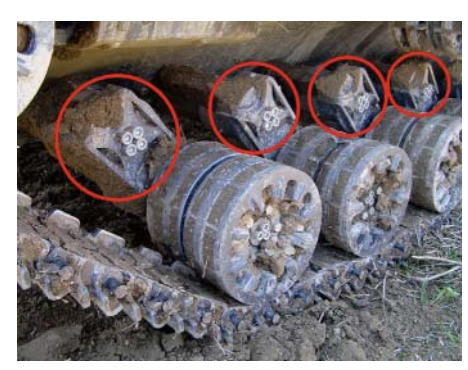
Elastic ROSTA suspension of the caterpillar guide rollers

The Digger D-2 is a 7 ton, armoured and remotely controlled caterpillar vehicle that uses a rotating frontal chain-roller drum for the "controlled" detonation of land mines hidden under the ground or in bushes. Thanks to its hydrostatic track drive, the Digger D-2 has a very high offroad capability, which is necessary in mined agricultural areas, some of which are very hilly.