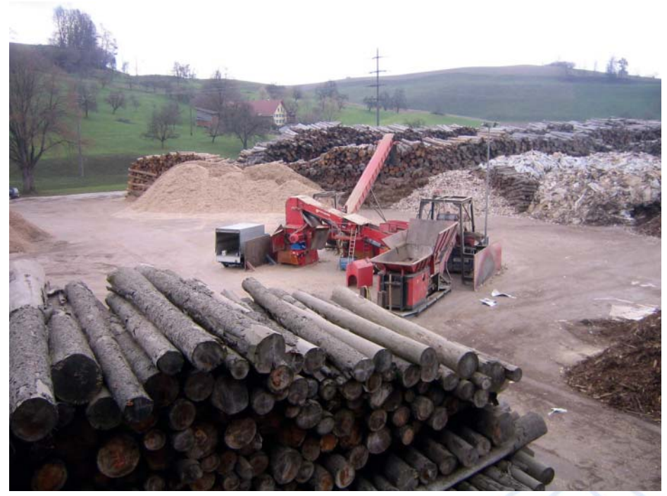
Splintering chipper in the chipboard plant

V-, trapezoidal and flat belts are mainly used for the drives of <u>unevenly</u> running machines. With the flexible drive component "belt" , so-called friction belt drives offer the possibility of compensating torque peaks, starting torques, impacts and shocks without negative backlash to the motor and gearbox. The flexible structure of the belt absorbs these peaks, and can dissipate them via the drive pulleys in the form of slippage.