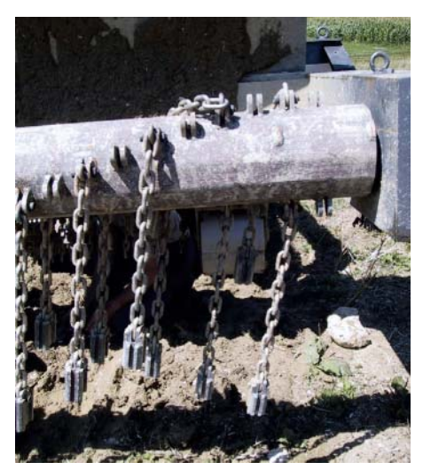
Rotary chain-roller drum for triggering mines

As a result of the turmoil of long passed civil wars, a large part of Africa, as well as wide areas in Asia, are still heavily mined, and people die every day as a result of detonating these mines while attempting to re-use these former battlefields for agricultural purposes.