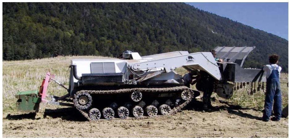
Digger D-2 mine-clearing vehicle

The Digger D-2 armoured mine-clearing vehicle is a development of the Digger Foundation (Demining Technologies), which has been realised with the support of the humanitarian Swiss Foundation for Mine Action (FSD).