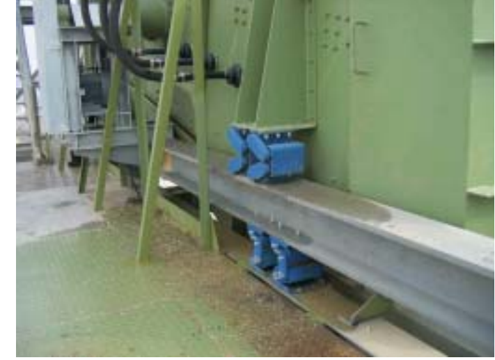
Fig. 2: Gravel dewatering screen with counter-frame on ROSTA AB's and AB-D's