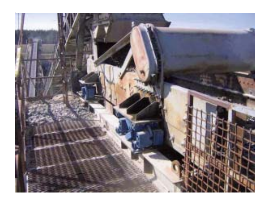
Fig. 1: Linear vibrating screening machine on ROSTA AB's in a very high steel-structure plant.

For maximum process efficiency, large, heavy screening machines, for example for the extraction of the various grain sizes of pebbles in the preparation of ready-mixed concrete, are always positioned at the highest point of the plant – high above the silos, crushers and concrete mixers (fig. 1). These screening machines weigh several tons, and are accelerated up to 5 g forces by their drives (unbalanced motors, unbalanced shafts or linear exciters), which generates very high dynamic forces.