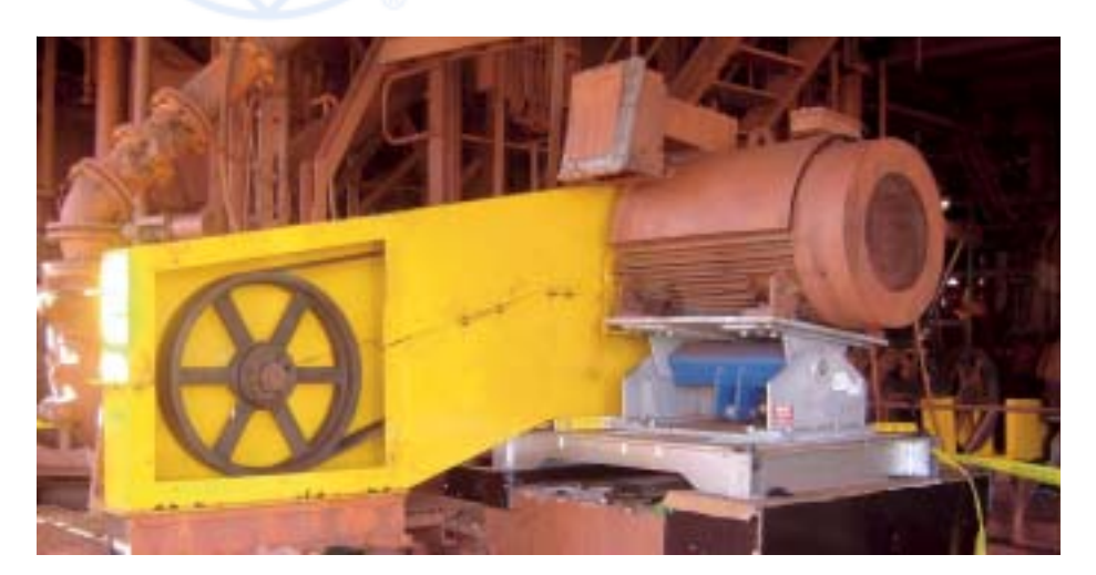
ROSTA motor base type MB 100 with 220 kW drive motor for a Warman centrifugal pump

The rotation-elastic ROSTA motor base type MB 100, with its slippage compensating operating mode, provides an ideal maintenance-free suspension for the drive motors used for big friction belt drives, e.g. on cyclone pumps, stone crushers, wood chip cutting machines, presses, punches, heat exchangers, centrifuges and stone saws. The flexibly mounted and pretensioned drive motor automatically compensates the belt elongation which occurs continuously and effectively eliminates torque peaks so achieving a vast improvement on the service life of the belt sets.