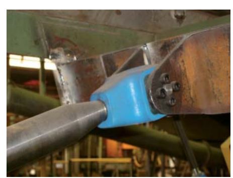
New drive-head system with ST 27

The matchstick vibrating conveyor from the year 1934, which has a slider-crank drive and a steel-leaf-spring suspension, has been running almost fault-free for 74 years in three-shift operation, although the leaf spring plates break relatively often due to material fatigue, which leads to production stoppages. Even though he was very fond of the 74-year-old machine, having to accept a loss of production in the match-stick packaging department several times a year of around two hours in each case was too much for the traditionally-minded Opera-