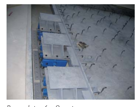
Base plate: 6 x 9 metre, Weight: 36 tons,

support elements. The height of the lower "sandwich" plate of the support can be adjusted using six adjusting screws in order to compensate for the initial settling of the rubber suspension units. In this "static" application, an initial settling of approx. 10 mm will take place over a few months.