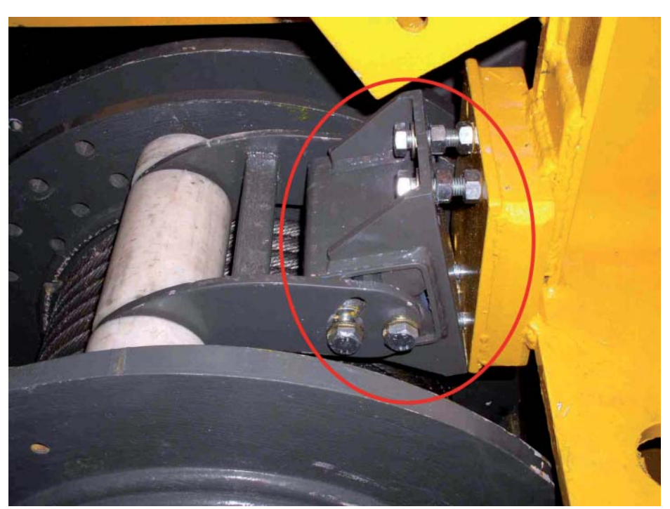
Guide roller equipment with ROSTA tensioning element

individual strands break away at the pinch locations due to the deformation tension that arises, and the whole, wonderful rope has to be replaced.