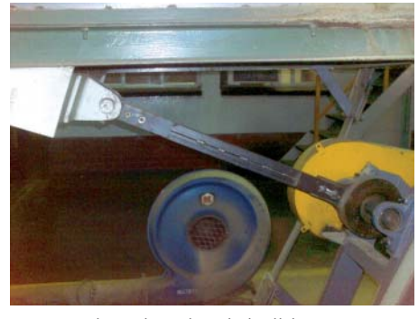
Former drive-head with ball bearing transmission

Within a few hours, the vibrating conveyor had been converted from leafspring suspension to ROSTA rocker arms, each consisting of two Type AU 18 oscillating mountings. The service replaced the ball mechanic also bearings of the slider crank drive, which were also susceptible to breakdown, with a Type ST 27 drive head from ROSTA. The "Oldtimer" has now been running again on the ROSTA suspensions in three shifts without any loss of production since May 2008 - and it will stay that way for at least the next ten years - silent, maintenance-free, dampened and operationally reliable.