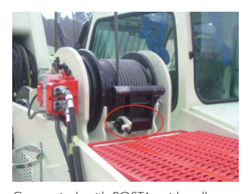
Crane winch with ROSTA guide roller

Their construction is robust and their function is guaranteed at all times by well-proven mechanical or hydraulic systems. The weak point in cable winches is the service life of the winch cables themselves. As a result of incorrect winding and unwinding, the steel ropes, which are subject to large tensile forces, can often become crossed, which crushes the structure of the twisted rope and the core of the rope, and thereby permanently deforms them. Within a short operating period,