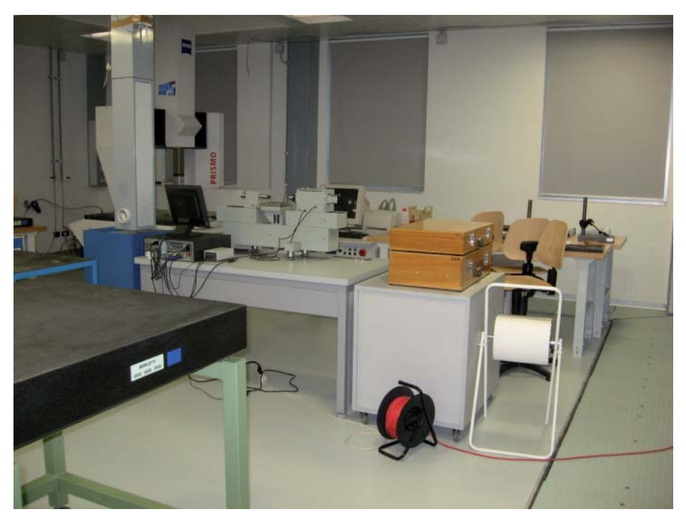
Calibration and measurement platform with instruments

As early as the planning stage for the test room for instrument certification, it was clear to the building owners that all