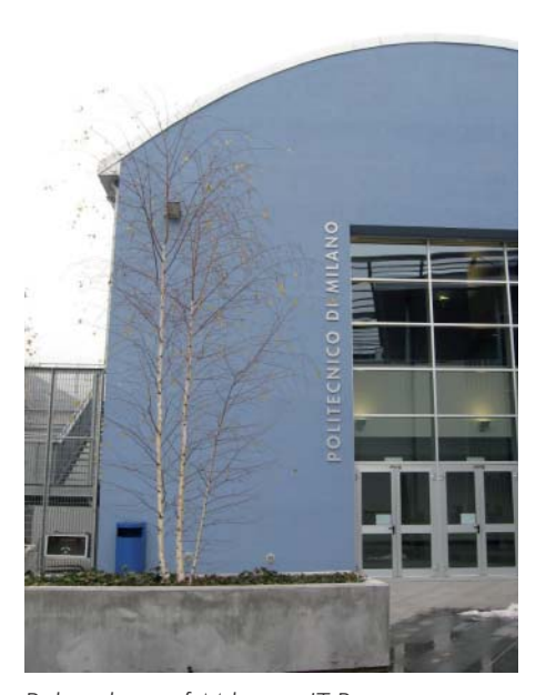
Polytechnic of Milan at IT-Bovisio

A few weeks ago, the new Polytechnic of the City of Milan started its operations in the Milanese suburb of Bovisio. The main North/South access lines of the railway pass through Bovisio, as well as two very busy motorway access roads. In addition, there are two large gantry cranes in the immediate vicinity of the Polytechnic, which broadcast vibration emissions through the ground.