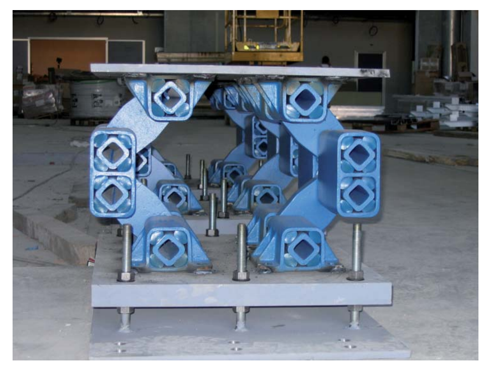
Nivelling "Sandwich-Plates", each with 2 AB 50-2 TWIN supports