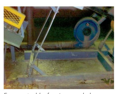
Former steel leaf-springs as shaker support