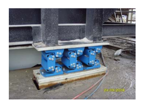
ROSTA Elements Type AB-D 50-2