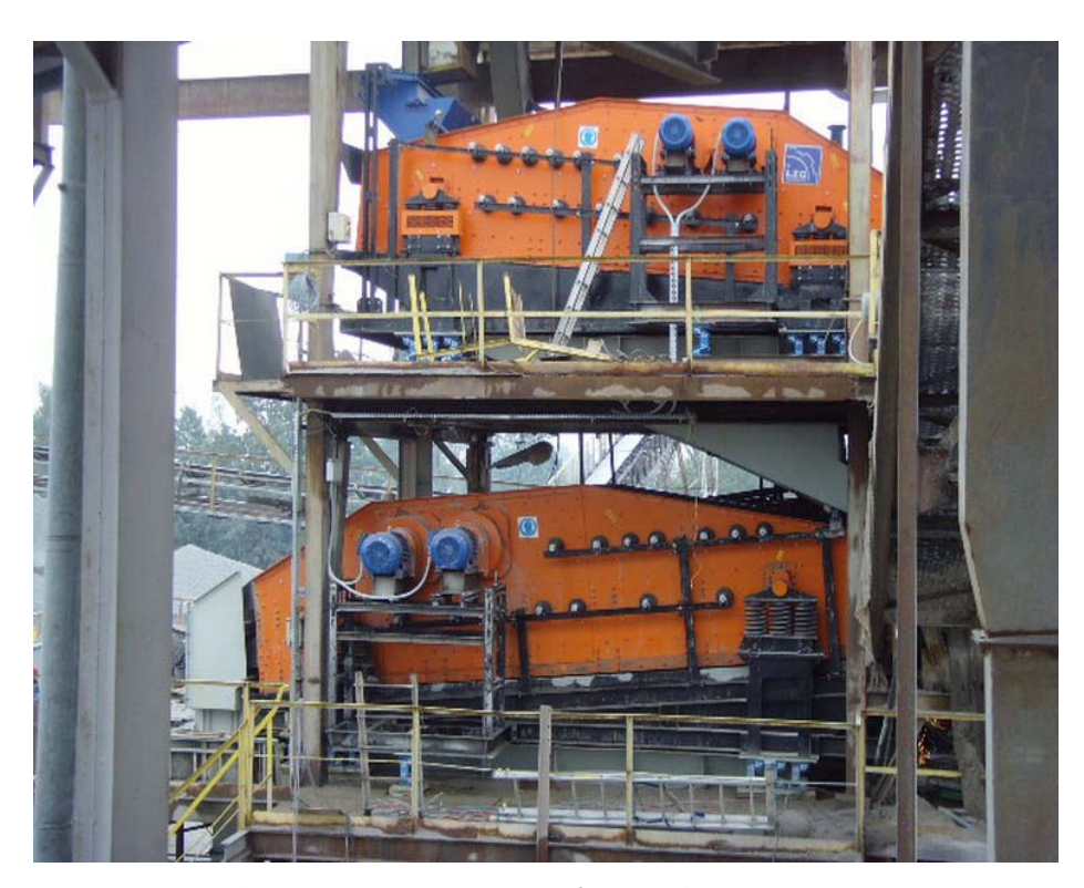
Two LZG linear vibratory screens on a counterframe with successive grain size selection (large grain outflow = upper screen; fine grain outflow = lower screen)