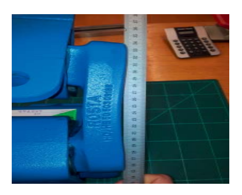
Test unit HS 50 after 10 times overload = slight deformation of the arms

We also need to produce detailed instructions for the following: